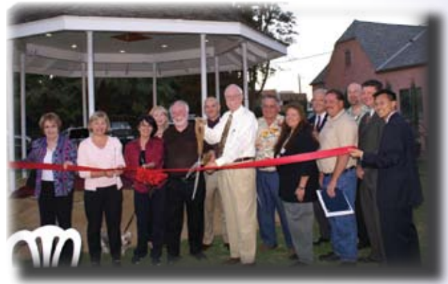
GuestHouse International Inn and Suites 1301 Chester Avenue • 661-327-7122 Restoration Reopening • Hotel