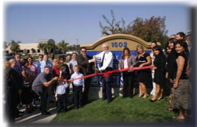
California Credit Information Solutions, Inc. 1502 Mill Road Way Suite 140 • 661-398-4700 New Location • Credit Information Services