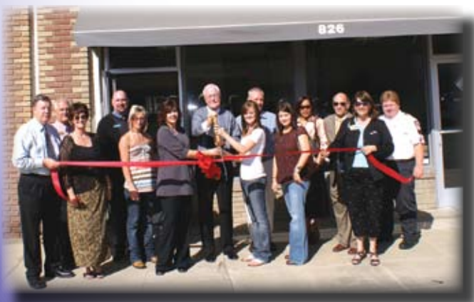
Evolution Esthetics Skin Care Spa 826 18th Street • 661-323-5880 Anniversary Celebration • Skin Care & Body Treatments Spa