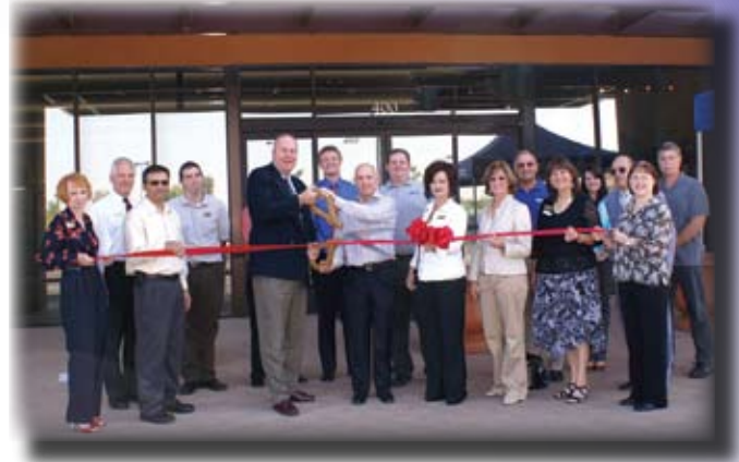
Action Sports 9500 Brimhall Road Suite 400 • 661-833-4000 Grand Opening • Retail Sporting Goods