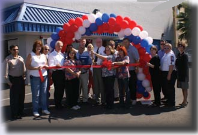
A-American Self Storage 711 Weedpatch Highway • 661-331-2247 Grand Opening • Self-Storage Units